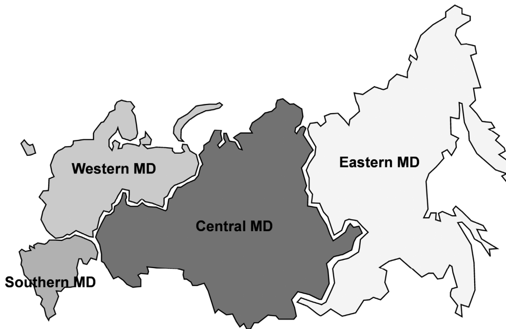
Figure 2: Russia's military district organization after December 1, 2010. The number of MD's decreased from six to four and at the same time they became strategic joint commands.

the city of Sovetsk in the Kaliningrad region. 48 The HQ of JSC 'West' is located in St. Petersburg.